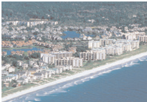
Litchfield Beach and Golf Resort

“Tee Shot Heard ‘Round the World” - 2008 returns to Myrtle Beach, SC this year and promises to be one of the best yet.