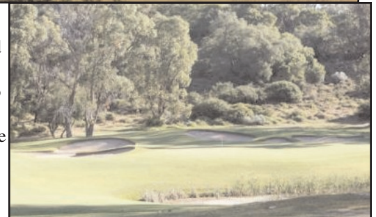
Binningup Golf Course near Bunbury, Western Australia